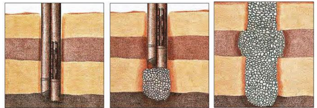
The vibro-flot penetrates the ground, and crushed local stone is fed in to the void, forming a dense column of compacted gravel.